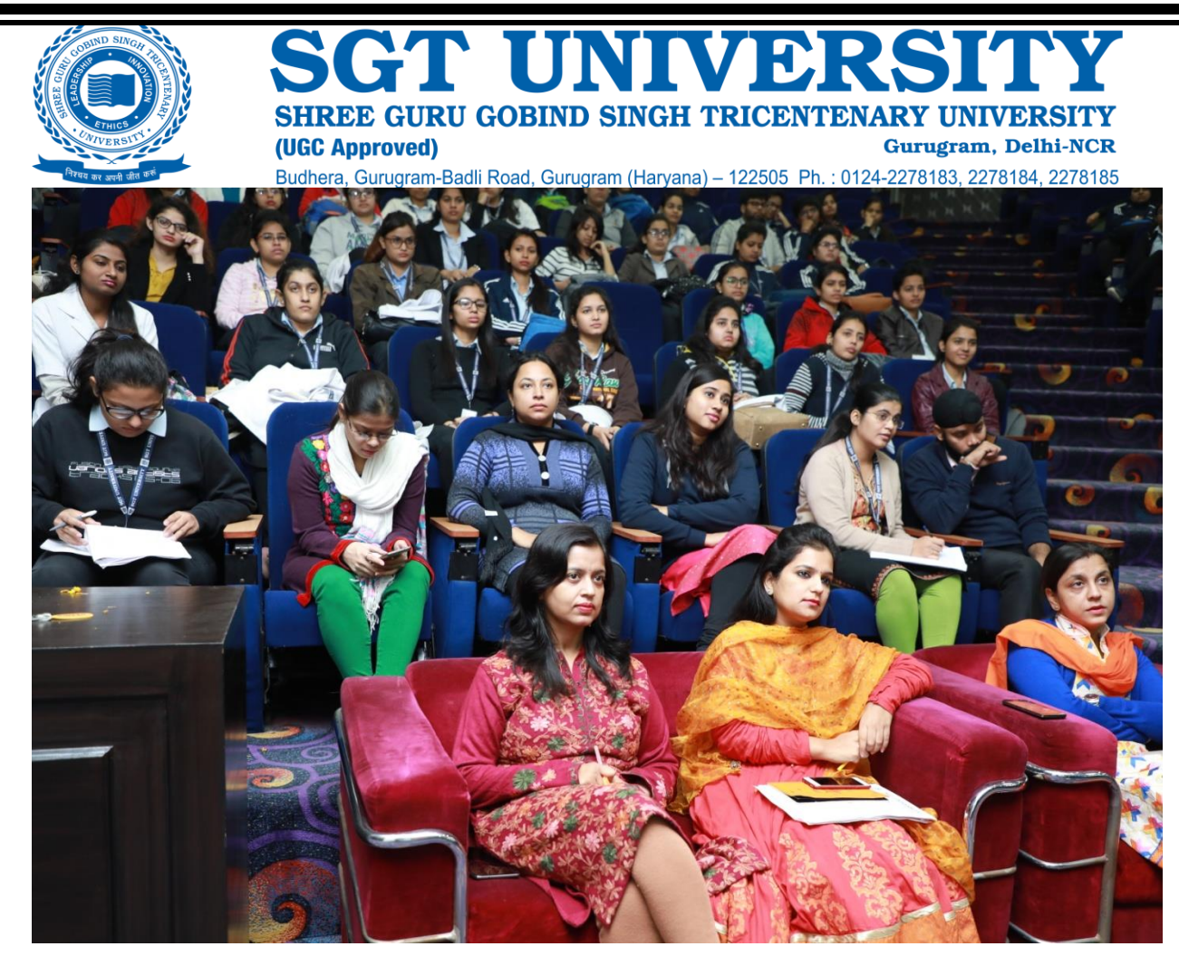
Figure 3 Participants interacting with Speaker