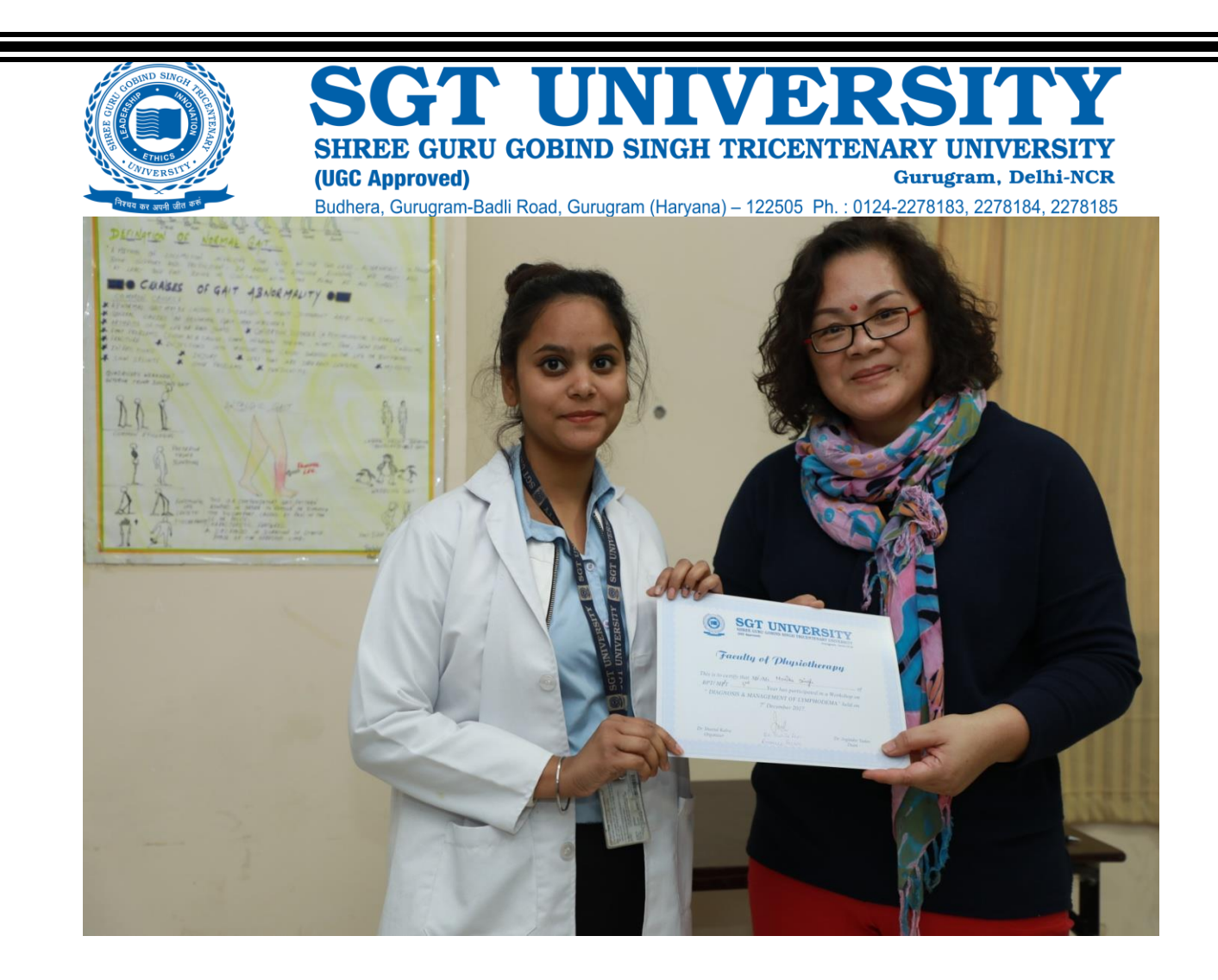
Figure 4: Felicitation of Students by Resource Person