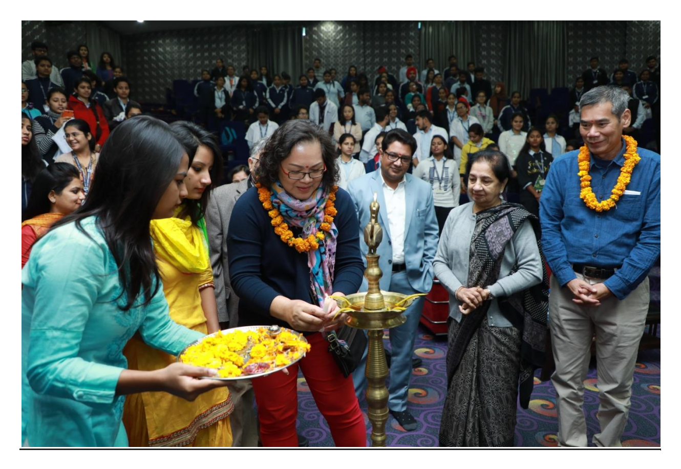
Figure 1: Inauguration of Event by the Guests

Budhera, Gurugram-Badli Road, Gurugram (Haryana) – 122505 Ph. : 0124-2278183, 2278184, 2278185